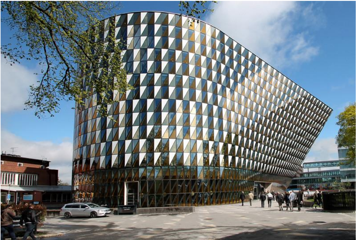
Figure 2: Aula Medica at Karolinska Institutet, Stockholm, Sweden